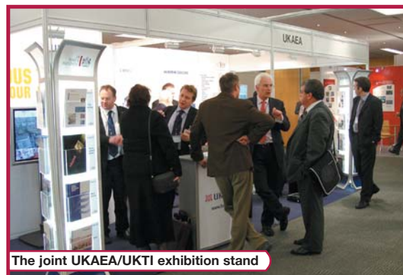
The joint UKAEA/UKTI exhibition stand

In addition to encouraging dialogue between representatives from industrial companies and fusion experts from ITER and the European Fusion